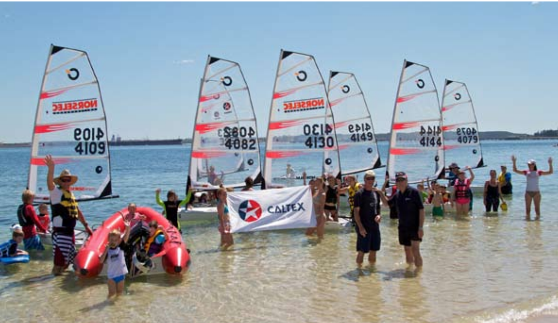
The Official handover of two sponsored boats by Caltex